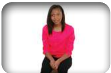
Strange events p20