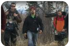
CLIL Behind the scenes p148