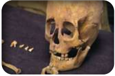
Mystery in the mountains p15