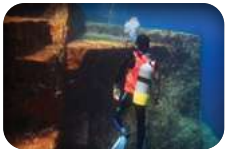
A story from under the sea p18